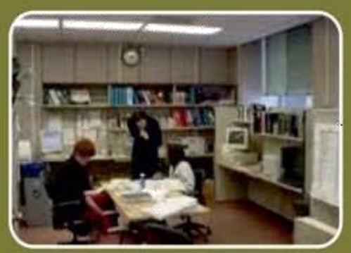
Drug Information Centre