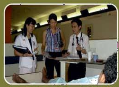
Ward Round Participation